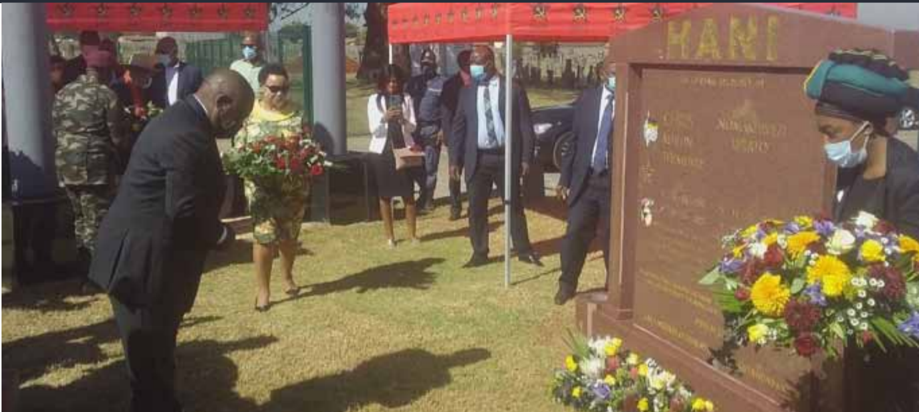
Wreath laying at Chris Hani's tombstone in Boksburg

On 10 April 2022 the South African nation and progressive people worldwide, commemorated the 29th anniversary of the death of Comrade Chris Hani, then general secretary of the South African Communist Party (SACP), who was murdered in cold blood. On that fateful morning of 10 April 1993, at 10h20, the right-wing assassin Janusz Jacob Walus, parked his vehicle at the driveway of the Hani house in Hakea Crescent, Dawn Park, Boksburg; and on alighting he called, "Mr Hani"; to which Comrade Chris Hani turned, only to be fired with a bullet from a 9mm pistol.