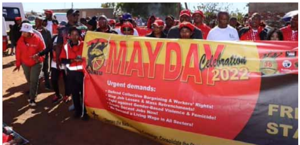
Workers and community members marching on May 1 at Trompsburg

'Government and business can do more to create more decent jobs. We believe that the state should continue to play an active role in making sure that jobs are created as espoused in our belief of what a developmental state should immerse itself upon', concluded Thihe.