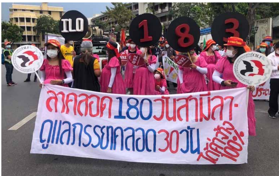
IndustriALL affiliates marching on the streets of Thailand demanding safe workplaces for vulnerable groups

IndustriALL affiliates in Sub-Saharan Africa came out to commemorate May Day, campaigning for the restoration of dignity in world of work. On May Day, Lesotho union IDUL officially opened its office in Buthe Buthe, aimed at improving service delivery to mine workers. Belgian union ACV-CSC have supported the construction of the office.