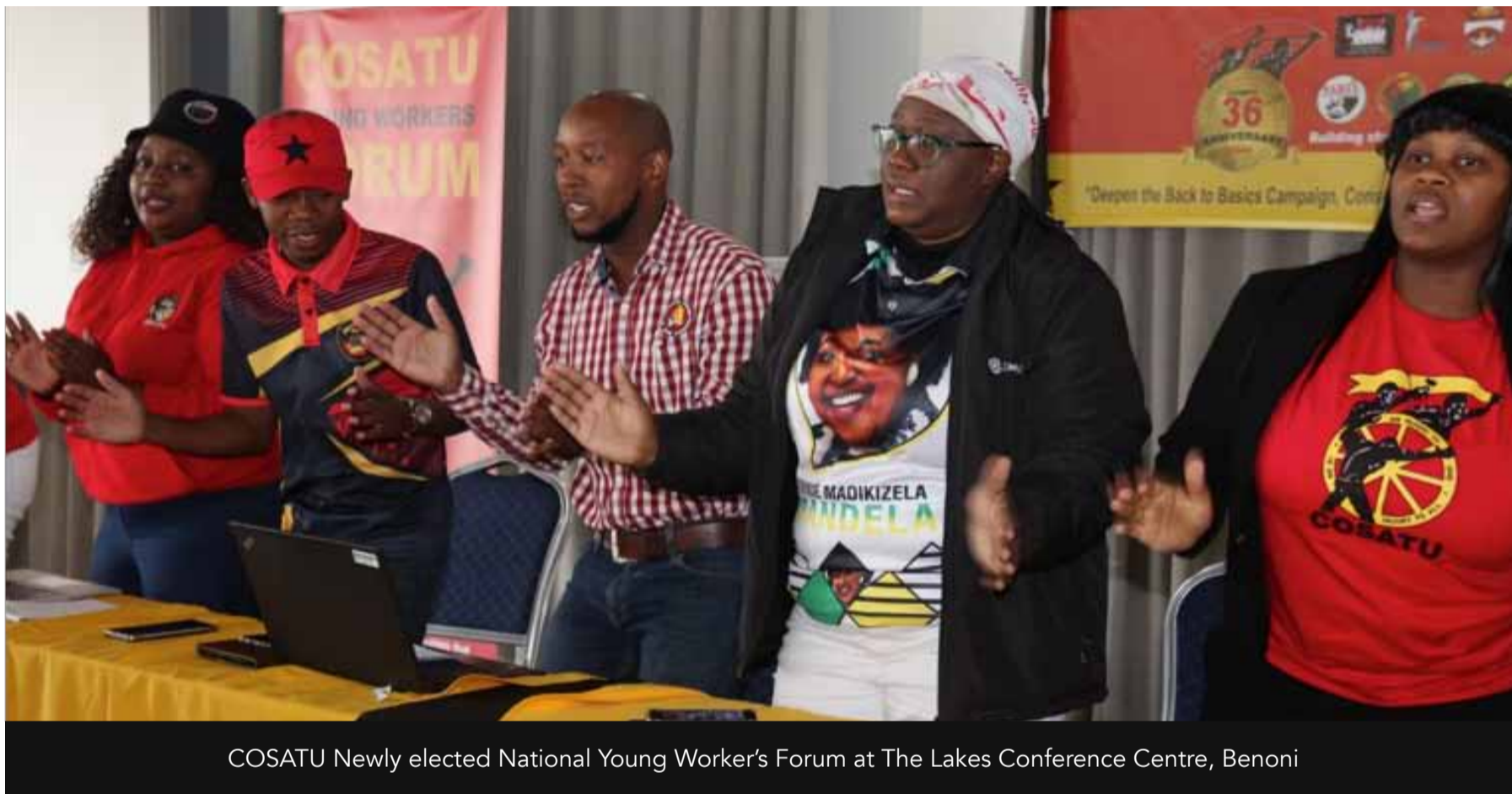
COSATU Newly elected National Young Worker's Forum at The Lakes Conference Centre, Benoni

Y oung workers across nine provinces gathered at The Lakes Conference Centre in Benoni around Ekurhuleni Municipality to, amongst others, mandate new leaders to lead youth programmes and campaigns within the federation.