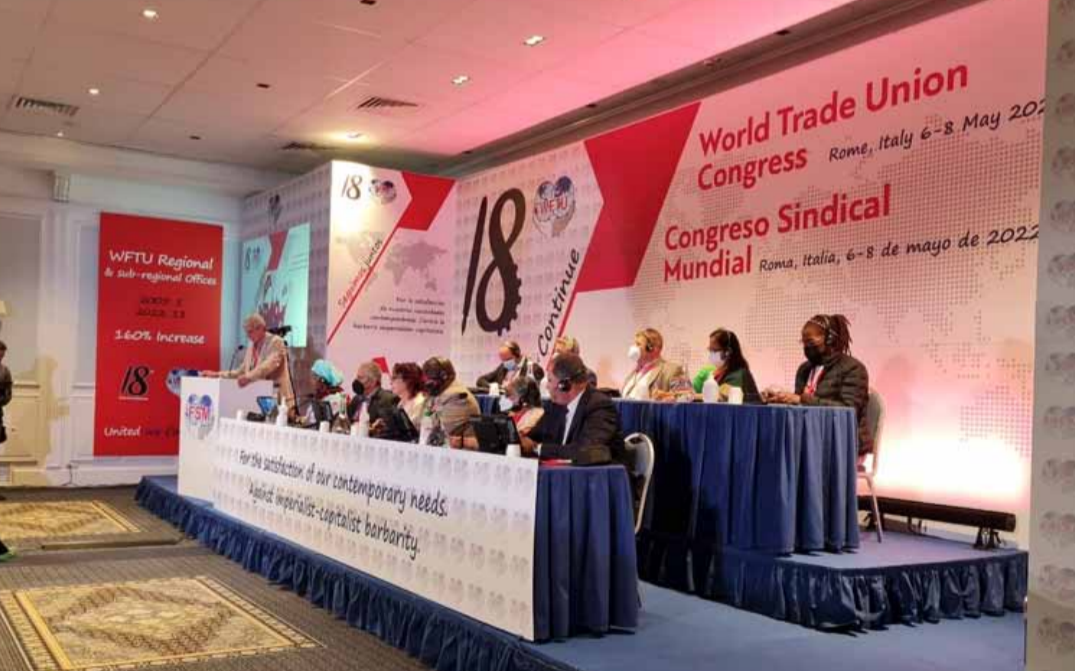
'United we Continue', declares WFTU 18th World Congress