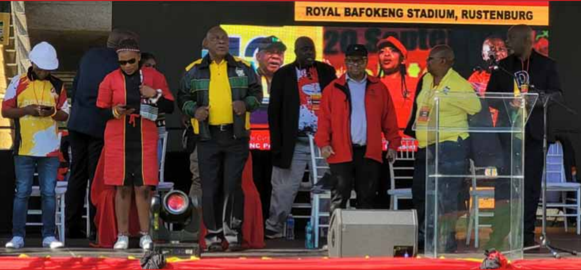
Alliance leadership getting ready to sing Nkosi Sikelele iAfrika at the Royal Bafokeng Stadium