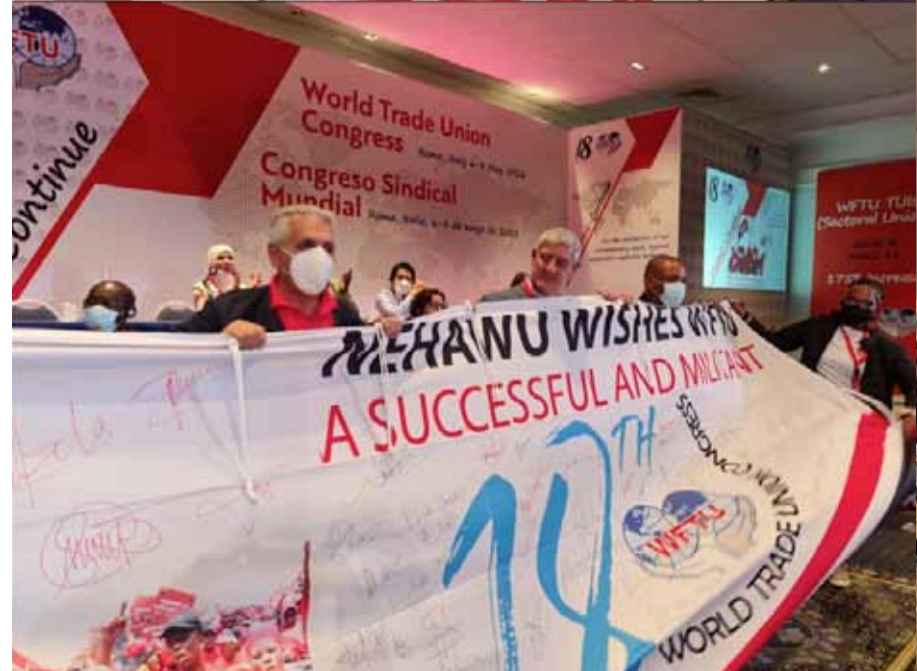
NEHAWU delegation handing over a banner to the hosting union of the WFTU 18th World Congress-Unione Sindacale di Base [USB Italy]