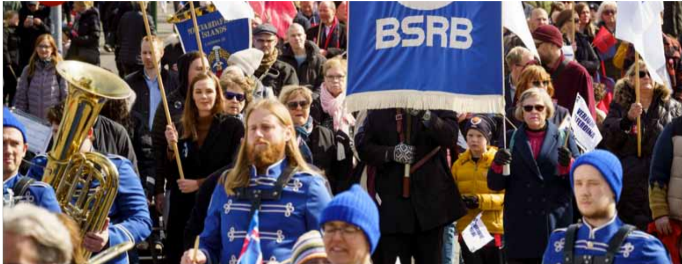
“This May Day, peace, solidarity, democracy and jobs are at the heart of a secure future” Sharan Burrow, ITUC General Secretary

intervention which has also lit the fire of war in Ukraine. We call for the dismantling of NATO, which in the last 25 years has launched two wars in Europe: in Yugoslavia in 1999 and now in Ukraine, just as it did with the wars in Libya, Afghanistan and Iraq’.