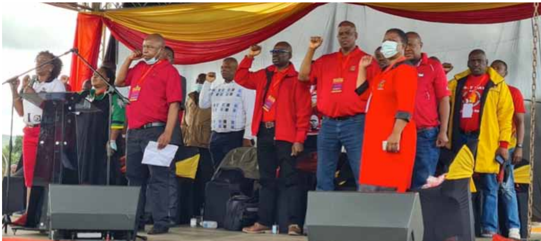
Comrades singing the National Anthem at the Limpopo COSATU May Day Celebrations

professionals and relieve them of the burden of continuing to deal with the worst cases of COVID-19, even after the removal of the Disaster management Act. COVID-19 is still around comrades'.